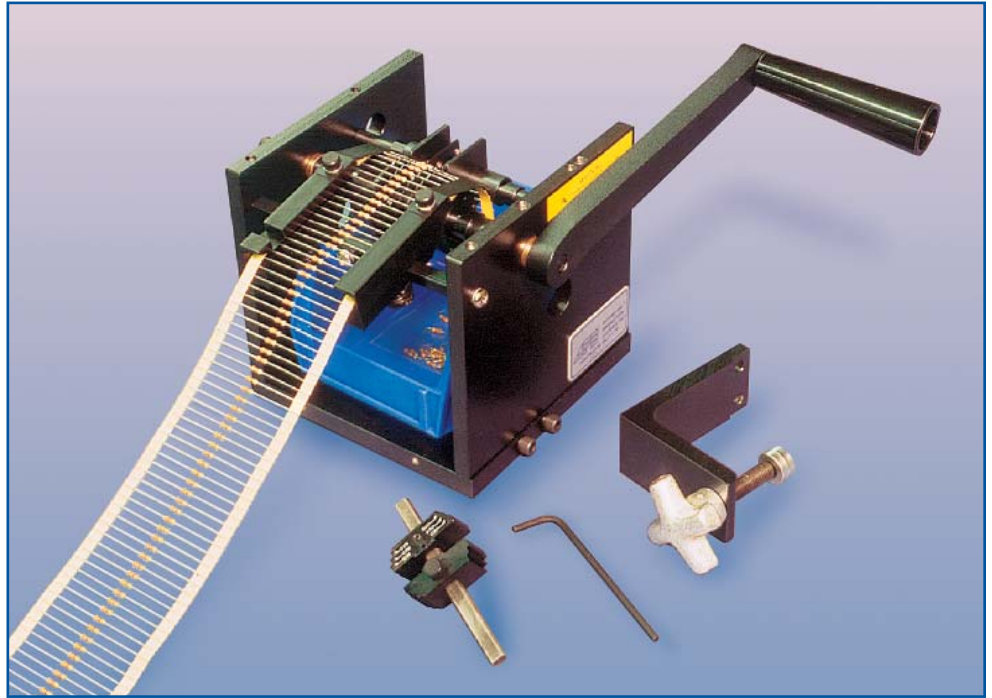
F-1 handcrank axial trimmer/former

Optional reel holder (RH-1) is available for both models.