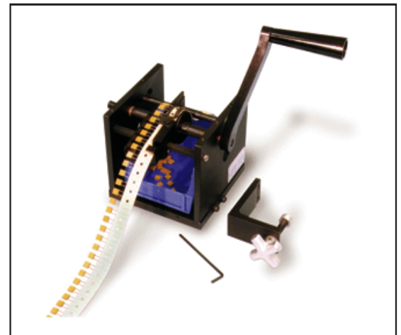
R-1 radial lead trimmer