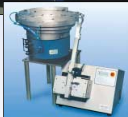
E-120 with Bowl Feed Option