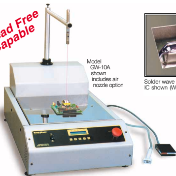
Model GW-10A shown includes air nozzle option