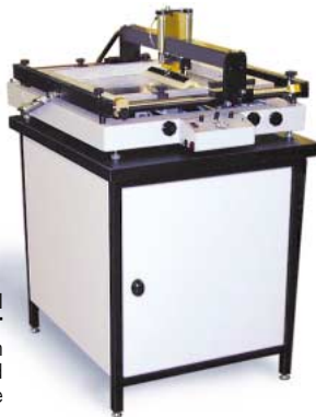
Model SPR-40/45-ST with stand option for stencil and supply storage