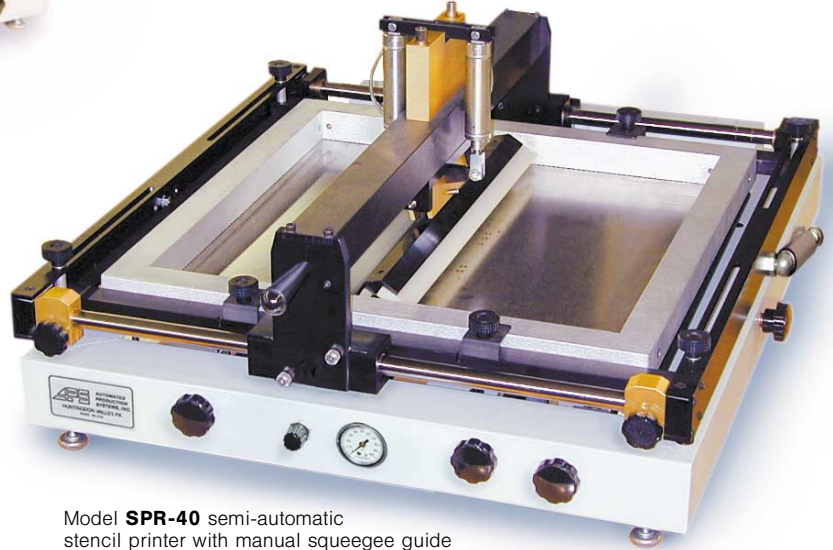
Model SPR-40 semi-automatic stencil printer with manual squeegee guide